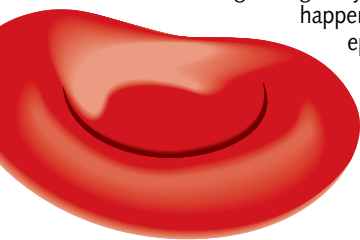
Normal blood cell

episodes of severe pain or damage to organs and tissues, and may lead to other serious medical problems.