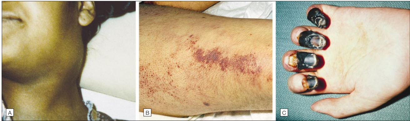
Figure 2. Patients With Naturally Occurring Plague

A, Cervical bubo in patient with bubonic plague; B, petechial and ecchymotic bleeding into the skin in patient with septicemic plague; and C, gangrene of the digits during the recovery phase of illness of patient shown in B. In plague following the use of a biological weapon, presence of cervical bubo is rare; purpuric skin lesions and necrotic digits occur only in advanced disease and would not be helpful in diagnosing the disease in the early stages of illness when antibiotic treatment can be life-saving.